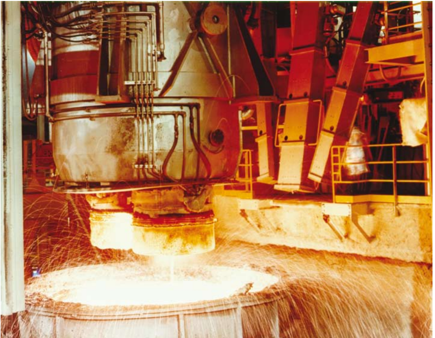
Overall process control in steel production