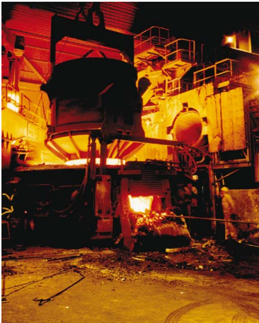
Process optimisation at steel plant with PSImetals

Additional models for dynamic process control of BOF steel plants as well as for facility spanning process control in secondary metallurgy are available for setting required target values. The models are optimally adapted to PSImetals treatment practices and use the specifications defined there for analysis and temperature as well as the stored restrictions and regulations. In this manner, it is ensured that the technological know-how necessary